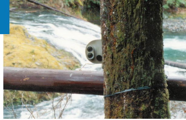
For photographic purposes, the counter has been mounted to be visible. Normally the counter would be hidden by the tree.

The new Millennium Trail Traffic Counter is a portable, battery powered instrument for counting trail traffic in remote areas. The original Trail Traffic Counter was designed and developed at the U.S. Forest Service Equipment Development Center. Diamond Traffic Products manufactured that unit for years under agreement with the Forest Service.